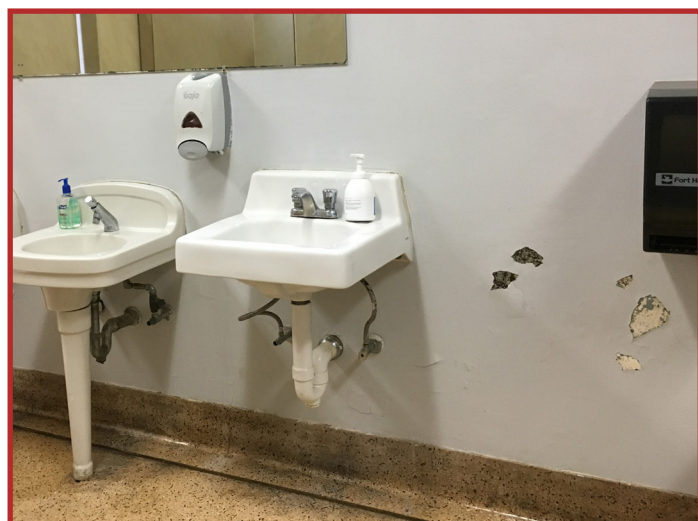
Elementary school bathroom in need of renovation