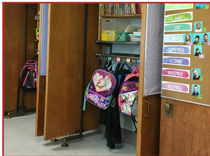
Elementary School classroom in need of renovations