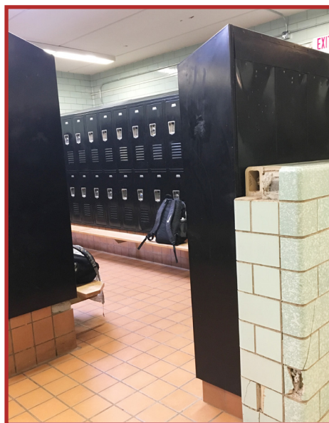
Junior/Senior High School Locker room in need of renovation