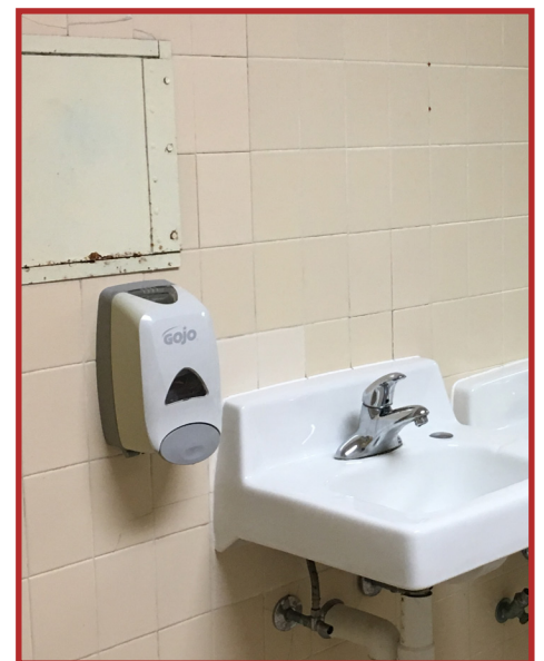
Junior/Senior High School bathrooms in need of renovation