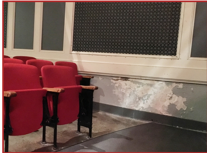
Elementary school auditorium in need of renovation