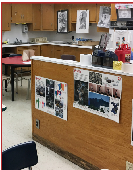
Junior/Senior High School art room in need of renovation