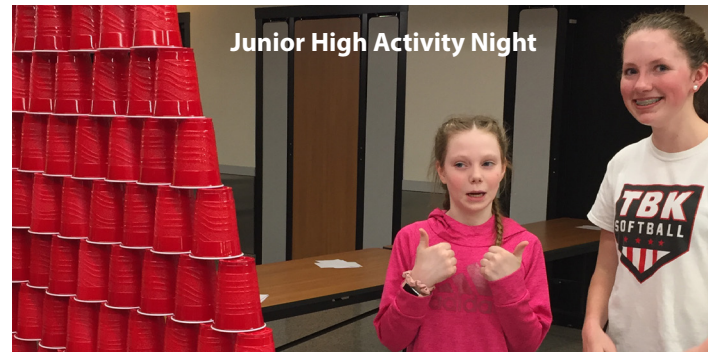
Junior High Activity Night

Check out alumni information on the Tully Historical Society website. Alumni are encouraged to share their thoughts and ideas as to our Annual Event program, which can be shared on the website or e-mailed to admin@tullyhistoricalsociety.org . Again, this event is open to ALL alumni, not just those years being honored or recognized. There will be an on-line reservation form on our website at the end of June.