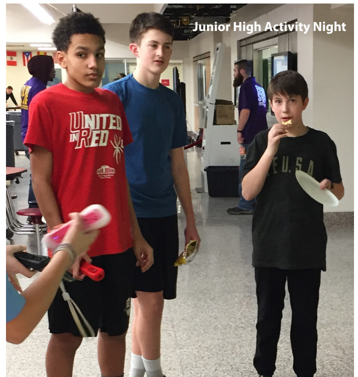
Junior High Activity Night