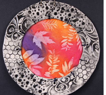
Artist: Gabby Flatt Title: Grimace and Cheeto