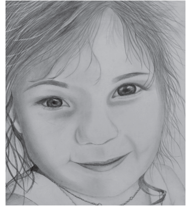
Artist: Aurora Randall Title: Aurora