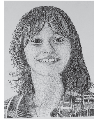
Artist: Brier Huggins Title: Llama