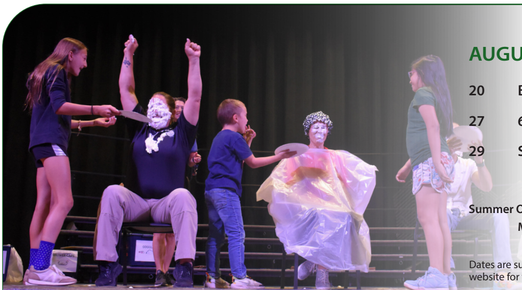
Pie Assembly at TES