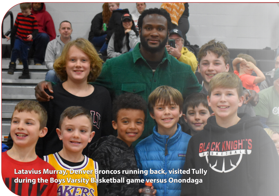
Latavius Murray, Denver Broncos running back, visited Tully during the Boys Varsity Basketball game versus Onondaga