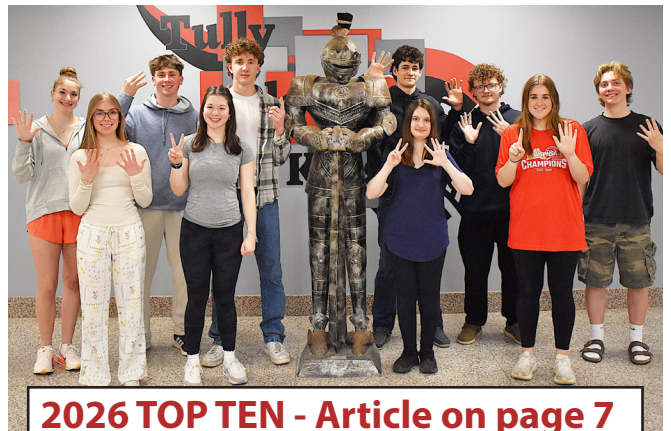
2026 TOP TEN - Article on page 7

Voting Location: Elementary School Gymnasium